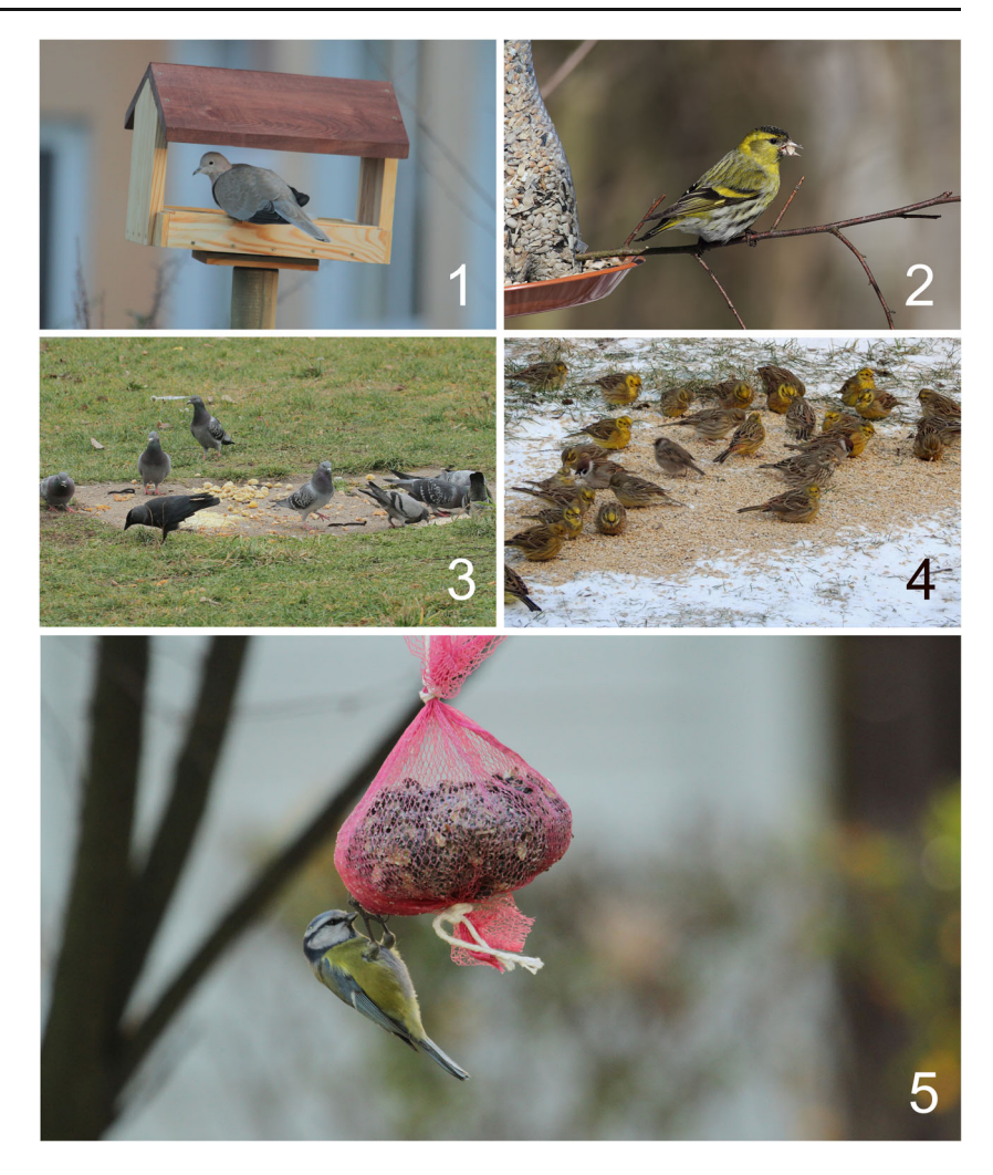
Fig. 1 Examples of the following bird feeder categories: 1 typical bird table feeders with a roof; 2 automatic-type feeder providing mixed seeds; 3 waste human food, such as bread and boiled vegetables on the ground; 4 seeds, mainly wheat and sunflower, placed on the ground; 5 pig fat mixed with some seeds and prepared as a ball

(Table A.1). The ten most common species in decreasing order of abundance were the following: house sparrow Passer domesticus , feral pigeon Columba livia var. urbana , great tit Parus major , rook Corvus frugilegus , jackdaw Corvus monedula , tree sparrow Passer montanus , greenfinch Chloris chloris , collared dove Streptopelia decaocto , blue tit Cyanistes caeruleus and magpie Pica pica .