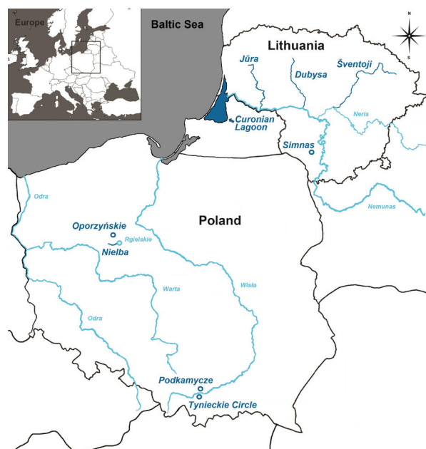
Fig. 2. Location of aquatic ecosystems selected for the harvesting of algal and cyanobacteria agglomerations during the project “Algae Service for LIFE” implementation

phyll a is used as proxy for phytoplankton biomass and phycocyanin – as cyanobacteria biomass marker. Moreover, occurrence of the hot-spots of algae and cyanobacteria agglomerations for most efficient biomass harvesting are hardly predictable due to water body peculiarities, its catchment characteristics, and variation in the environmental factors (seasonal timing, temperature, wind direction). Distant methods can increase the economic feasibility of harvesting and allow quickly define the target location of algal and cyanobacteria agglomerations and the best period for biomass collection with minor time input. Satellite images have already been proposed for monitoring of large water ecosystems (VARUNAN & SHANMUGAM, 2017), also for the Curonian Lagoon (BRESCIANI et al., 2014). However, they are not suitable for bloom monitoring in small water bodies. Although satellites nowadays provide high resolution images, price is too high to use them for cyanobacteria and algae harvesting in small water bodies. Therefore, UAV was selected as the best alternative for the methodology