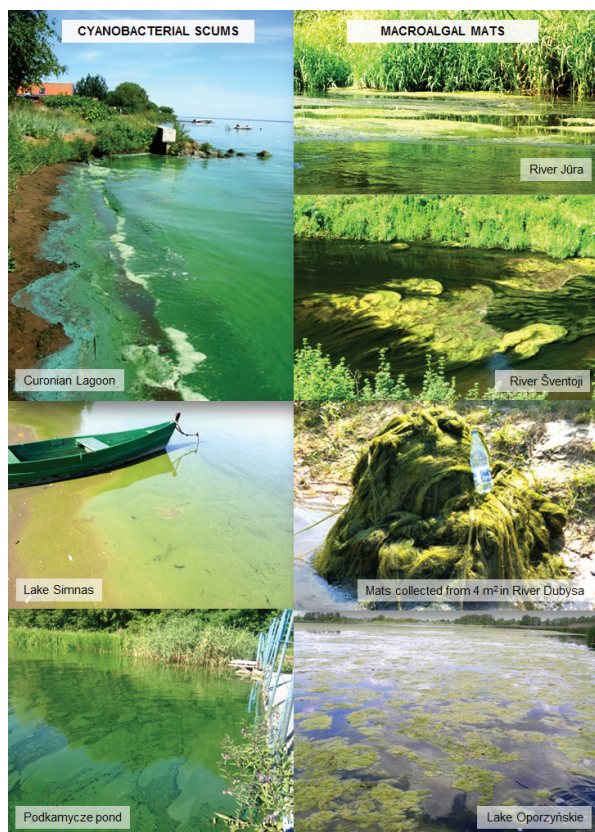
Fig. 3. Cyanobacteria and macroalgal blooms in Lithuanian and Polish water bodies

in small freshwaters. For this reason, the multidisciplinary approach to detect blooms through the combined use of the data received in situ and from remote sensing tools will be applied. In the project, we seek: i) to demonstrate suitability of distant methods to increase economic feasibility of algal harvesting; ii) to develop new methodology for bloom monitoring in inland small water ecosystems based on UAV images.