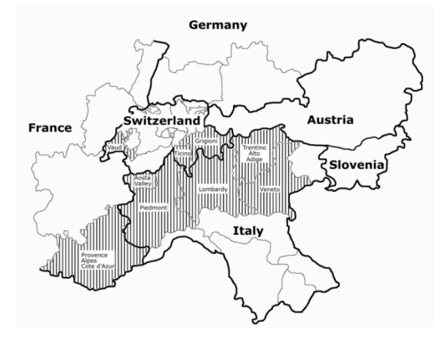
Figure 1. Sampling regions or cantons (striped areas) distributed along the Alps, and States t which they belong.

States were covered by enchytraeids species sampling, identification and description ( Figure 1 and Table 1 ): France and Switzerland on the Northern side of the Alps, and, on the Southern side, Italy. In France only the Provence-Alpes-Côte d'Azur region was considered, while in Switzerland three main cantons were explored (Vaud, Ticino and Grigioni). In Italy five regions were extensively run: Piedmont, Aosta Valley, Lombardy, Trentino-Alto Adige and Veneto.