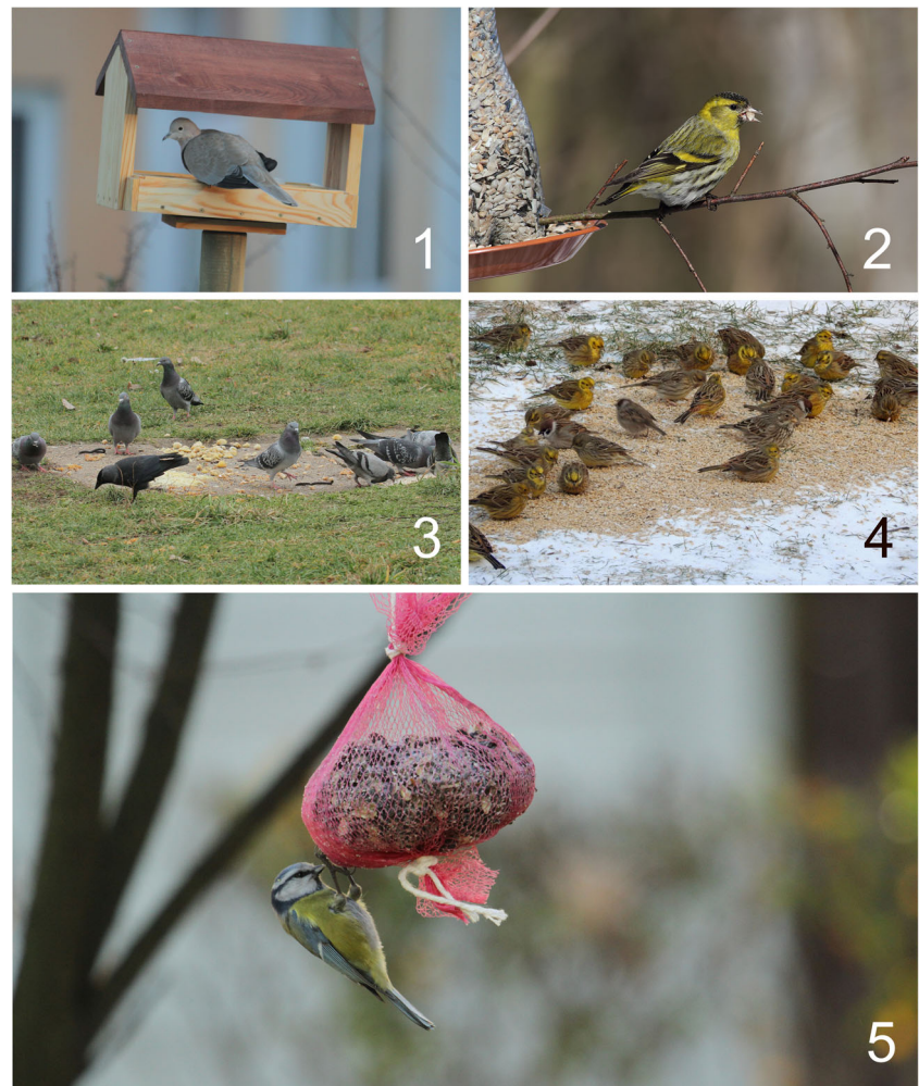
Fig. 1 Examples of the following bird feeder categories: 1 typical bird table feeders with a roof; 2 automatic-type feeder providing mixed seeds; 3 waste human food, such as bread and boiled vegetables on the ground; 4 seeds, mainly wheat and sunflower, placed on the ground; 5 pig fat mixed with some seeds and prepared as a ball

(Table A.1). The ten most common species in decreasing order of abundance were the following: house sparrow Passer domesticus , feral pigeon Columba livia var. urbana , great tit Parus major , rook Corvus frugilegus , jackdaw Corvus monedula , tree sparrow Passer montanus , greenfinch Chloris chloris , collared dove Streptopelia decaocto , blue tit Cyanistes caeruleus and magpie Pica pica .