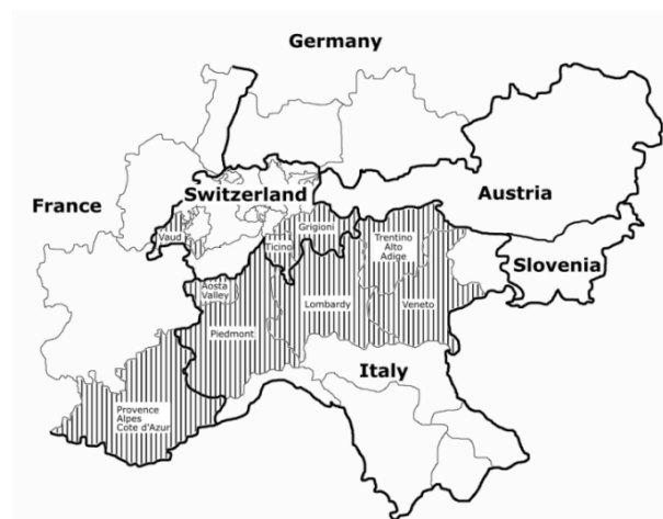
Figure 1. Sampling regions or cantons (striped areas) distributed along the Alps, and States to which they belong.

States were covered by enchytraeids species sampling, identification and description ( Figure 1 and Table 1 ): France and Switzerland on the Northern side of the Alps, and, on the Southern side, Italy. In France only the Provence-Alpes-Côte d'Azur region was considered, while in Switzerland three main cantons were explored (Vaud, Ticino and Grigioni). In Italy five regions were extensively run: Piedmont, Aosta Valley, Lombardy, Trentino-Alto Adige and Veneto.